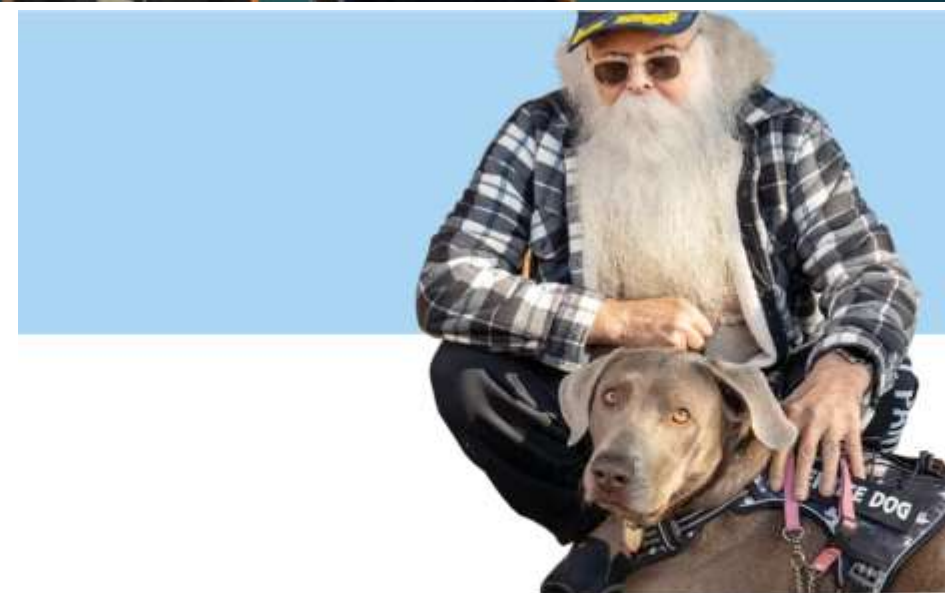
D-DAY ANNIVERSARY WORLD WAR TWO VETERANS RETURN TO NORMANDY