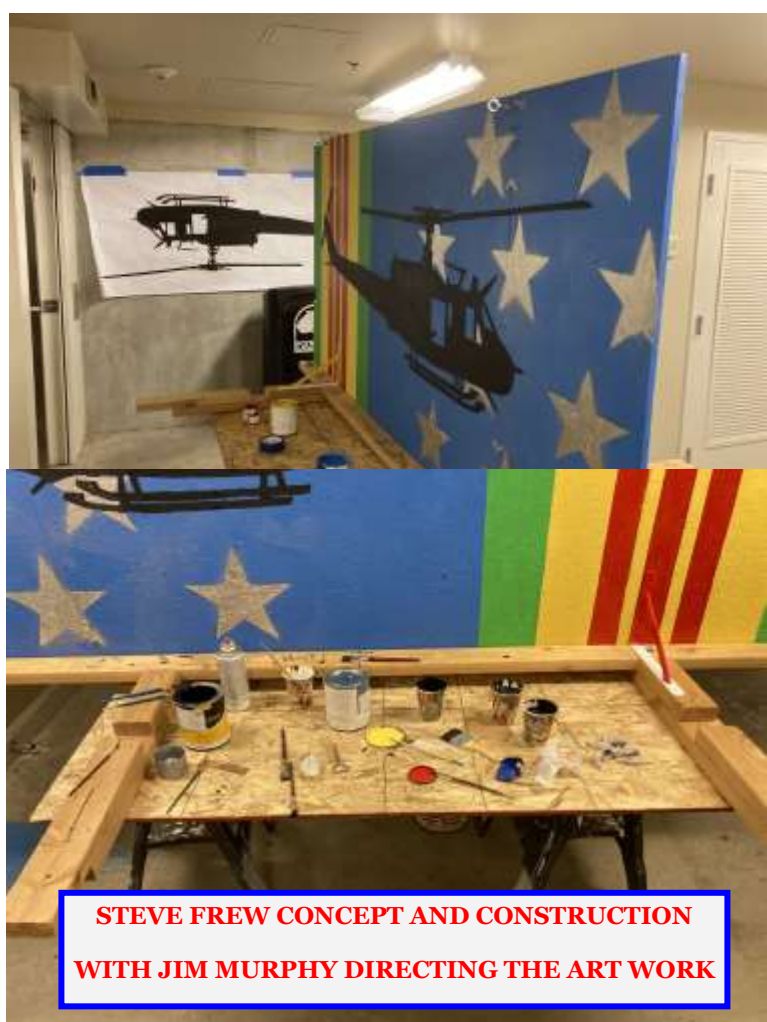
STEVE FREW CONCEPT AND CONSTRUCTION WITH JIM MURPHY DIRECTING THE ART WORK

Veterans Day Parade Pleasanton - Sun. Nov 5